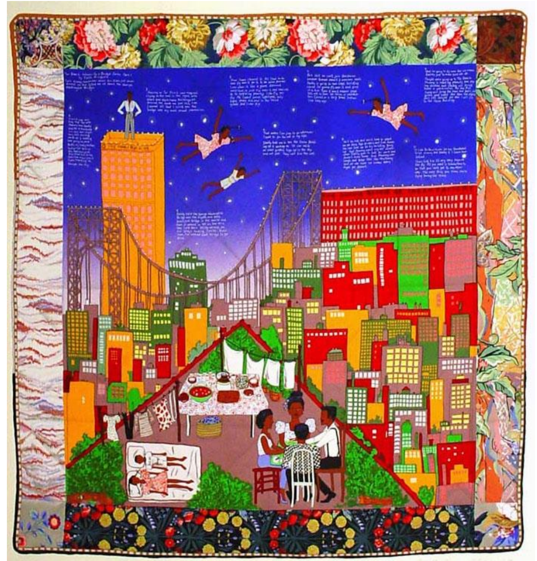
“Tar Beach #2” Faith Ringgold (1992) The Fabric Workshop and Museum, Philadelphia